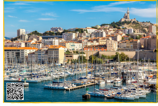
Marseille: A major port near the French Riviera, at the foot of the Parc national des Calanques