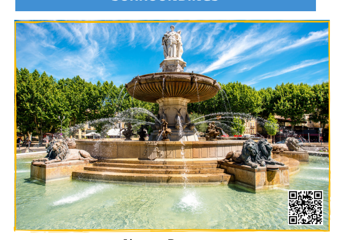
A vibrant historic City and arts center